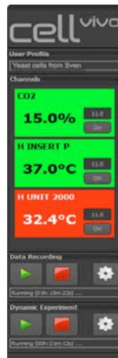
Widget style cellVivo application, attached to your imaging software.

cellVivo is a modular system, enabling users to purchase only what they need. The range of models and modules available makes it easy to build either a premium high-end product with advanced housings and environmental control options, to a very basic solution for just temperature control with a transparent housing.