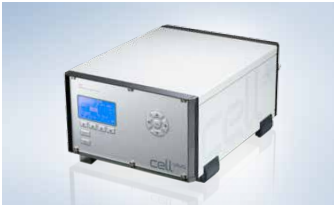
Olympus CB2G controller for CO 2 and O 2 control.

cellVivo provides reliable control of temperature up to 0.05°C accuracy as well as gas (CO 2 and O 2 ) control from 0 to 20%. It exchanges the complete sample environment five times per minute for very tight condition control and 0.1% accuracy.