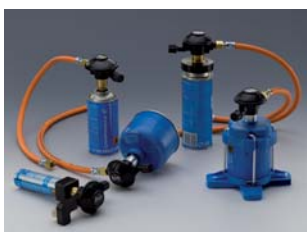
Choice of gas cartridges with adapters, partially including pressure reducer and gas-safety hose.