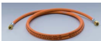
Gas-safety hose for propane/butane, screwed (DVGW-certified)

Sources of energy? You need it - we have it