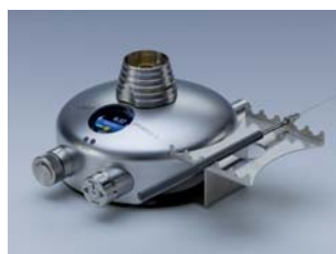
Instrument tray with inoculating loop holder, rotatable for optimum workplace convenience