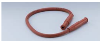
Gas-safety hose for natural gas, slip-on (DVGW-certified)

If the flame stops due to e.g. spilled liquids and the burner may not be re-ignited, the gas supply is automatically and permanently shut.