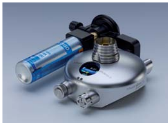
schuett phoenix II with CV 360-adapter incl. pressure reducer and cartridge

Sources of energy? You need it - we have it