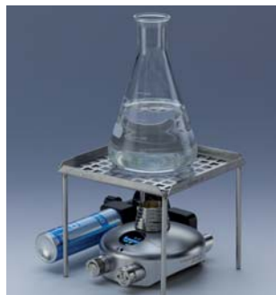
Hot-Tray with schuett phoenix II and CV 360-adapter/cartridge for operation in chemical lab (height-optimized)