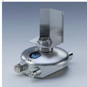
schuett phoenix II with flame shield