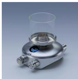
schuett phoenix II with glass spatter guard