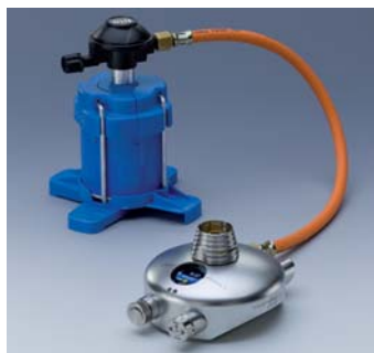
schuett phoenix II with C 206-adapter incl. pressure reducer and gas-safety hose as well as cartridge

The delivery extent of the schuett phoenix II includes a nozzle for natural gas as well as a nozzle for propane/butane gas. In few steps, the nozzles may be exchanged or replaced, without need for tools, according to the required gas.