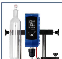
High Torque Overhead Stirrer OHS.4

Approx. Stand Dimensions ( W x D x H): 440x 420x1200mm